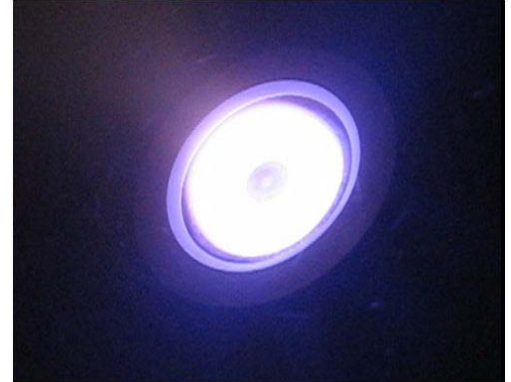
Arc suppression of Ion™ 1500 working in same environment & conditions - producing a stable plasma & good target utilization with negligible arc induced damage