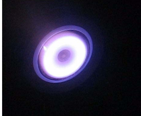
Same view & conditions as at left, but with plasma re-igniting - arcing is still decaying